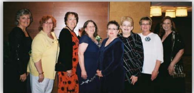
SSC Members at the Banquet

I look forward to next year's division conference but can't really wait until then...Fall Conference is on my radar – since I didn't plan to attend EFAM and don't have the funds to do it this year (next year for sure)! These meetings offer fantastic opportunities to learn about what the future holds for the association as well as connect us with other members in our division. For the next meeting I attend I will have my goals mapped out prior to leaving my doorstep, and I already have a few – to network with more members outside of my immediate chapter and to stay on-site so that I can take advantage of those unplanned networking opportunities that arise. Because of this meeting I am looking forward to our upcoming year with passion and purpose. I hope to see more of you at the next one!