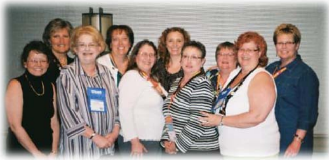
SSC Members at the Friday Seminar